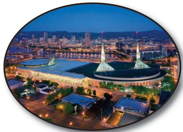
Oregon Convention Center Portland, Oregon